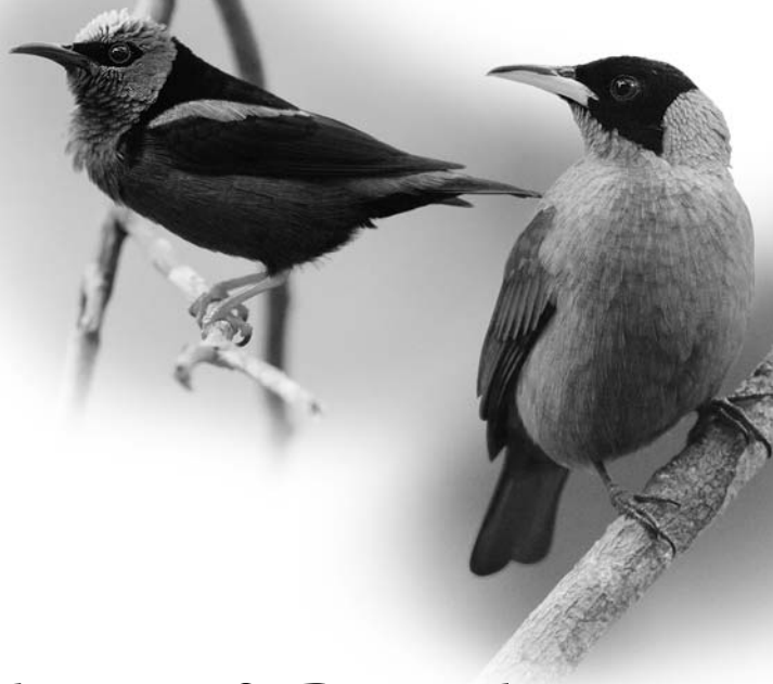
Left: Red-legged Honeycreeper ( Cyanerpes cyaneus ). Right: Green Honeycreeper ( Chlorophanes spiza ) taken during the 108th CBC.