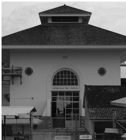
The hydroelectric power generating station at the spillway on the Panama Canal.

It is unlikely that Panama will regain the top spot again, at least with the current set of count circles. We simply don't have a large enough pool of birds to compete with other more diverse sites. But we are also missing many of the better birders who have moved back to the states, and although there are many good Panamanian birders, many of them have become guides and they don't have time to participate during the winter tourism high season. We have also lost access to some of the prime birding areas, related to the change in use of the canal area from a very restricted single-use area for operating the canal to part of a rapidly growing metropolitan area. Panama